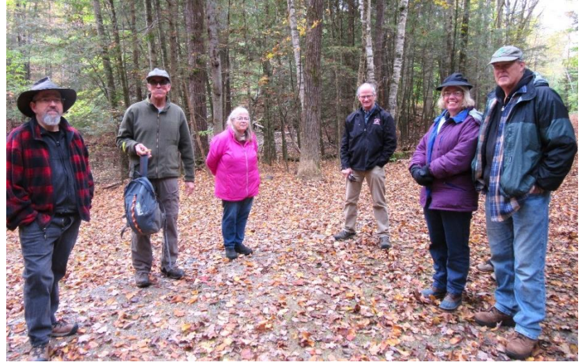
Most of the group on the railbed near the north pits.